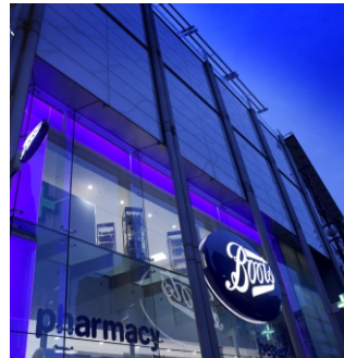
"Goal post" entrance to the Alliance Boots store

over 450 bright blue LEDs with Prismex panels, spread over two floors at the entrance to the store and makes an eye-catching entrance to the store.