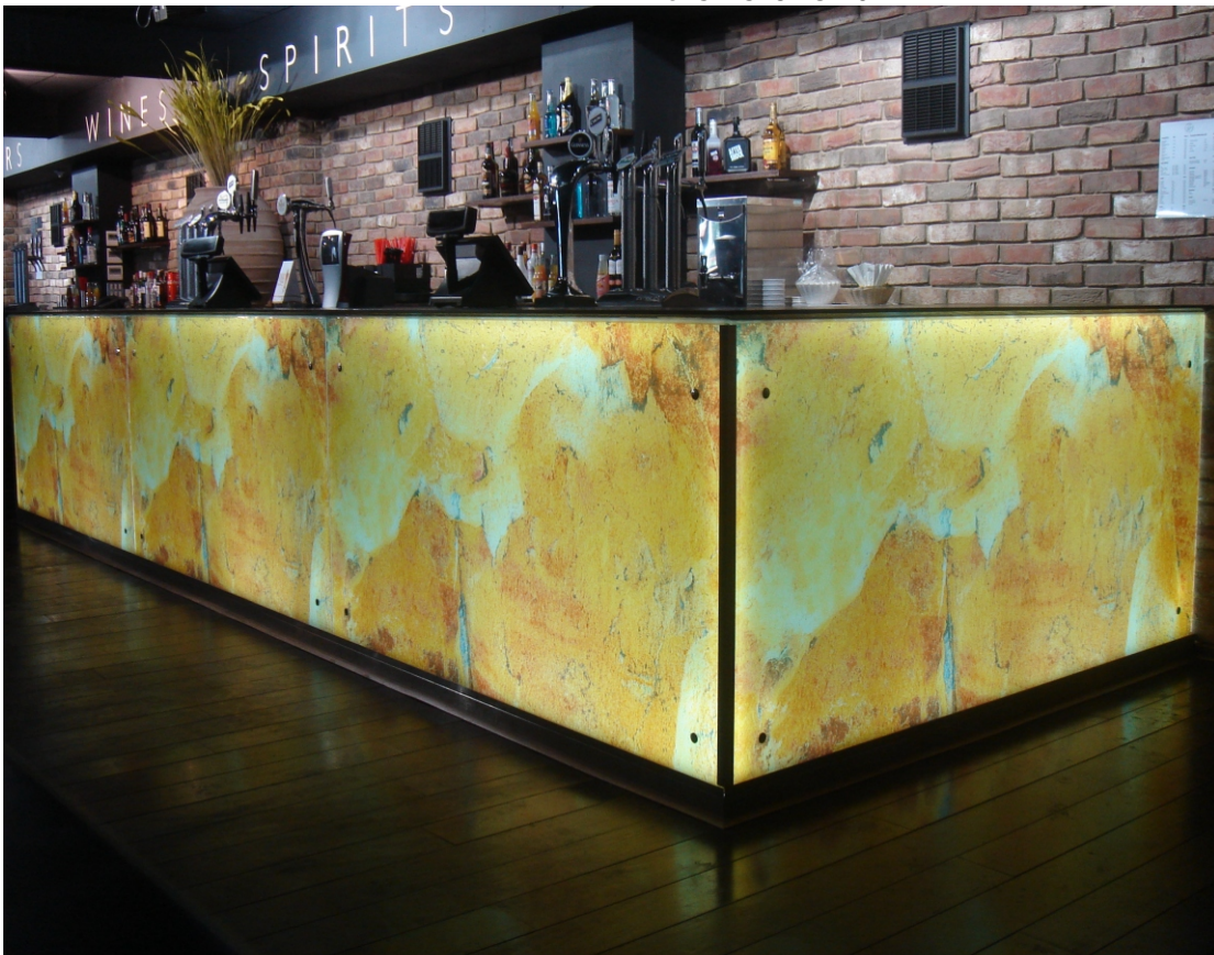
Yellows Bar, Norwich City Football Club

"We were able to work closely with the interior designer and installed a special light emitting acrylic behind the laminated glass panels across the front of the bar and down the side returns of the bar. The acrylic panels were then edgelit with LEDs. The client is very happy with the outcome and is looking forward to welcoming fans to the Yellows Bar."