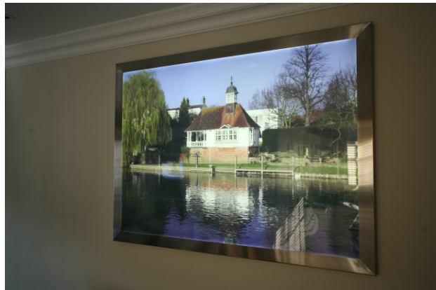
Stainless steel framed Lightframe

edge lighting the splashback of a client's new kitchen with LEDs. Earlier in the year we supplied a private client with one of our ultra slim Lightframe lightboxes – the client wanted the frame to match other furniture in the house and so we edged it with stainless steel to create a modern, minimalist illuminated frame for his photograph.